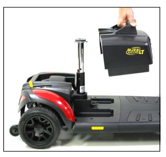
Figure 15. Removing the Battery Pack