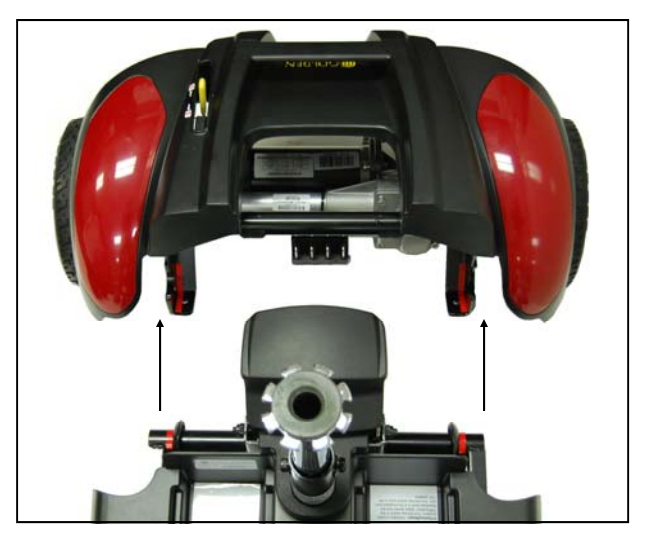
Figure 19. Drivetrain Alignment

3. Gently lower the battery pack onto the frame. See figure 21.