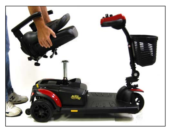
Figure 14. Removing the Seat

3. Grip the seat on opposite sides and, with a firm grip; pull the seat straight up. See figure 14.