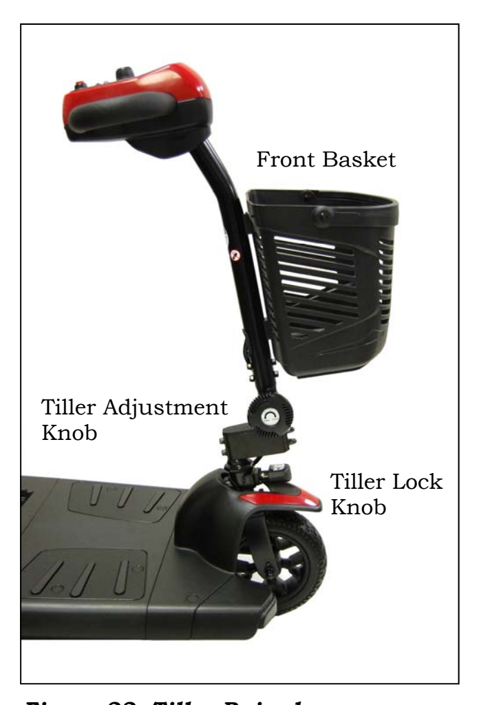
Figure 22. Tiller Raised

WARNING MAKE SURE YOU TIGHTEN YOUR TILLER ADJUSTMENT KNOB TO BE SURE IT IS SECURED IN THE DESIRED POSITION!