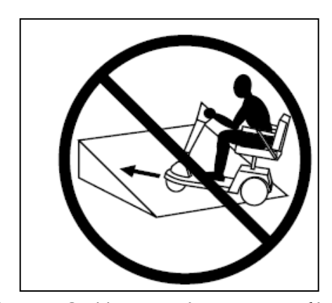
Figure 3. Traversing an Incline

WARNING If, while you are driving down a slope, your scooter starts to move faster than you feel is safe, release the throttle control lever and allow your Buzzaround Lite to come to a stop. When you feel that you again have control of your scooter, push the throttle control lever forward and continue safely down the remainder of the slope.