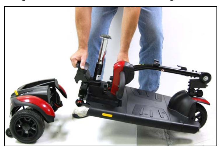
Figure 17. Separating the Drivetrain and Frame