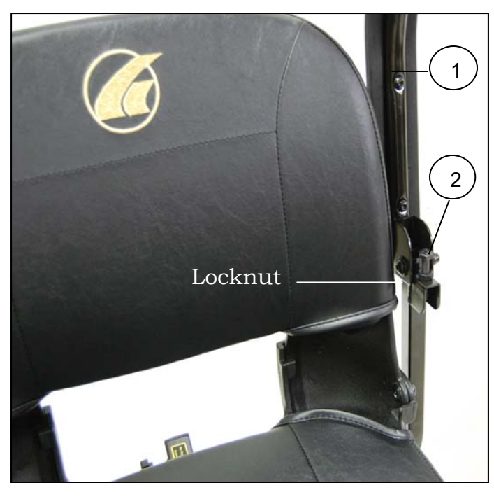
Figure 7. Armrest Angle Adjustment