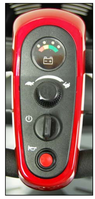
Figure 12. Key Switch (Off)