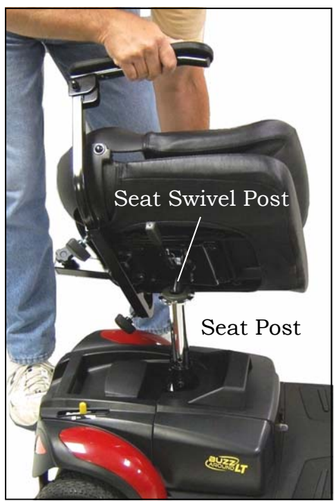
Figure 23. Installing the Seat