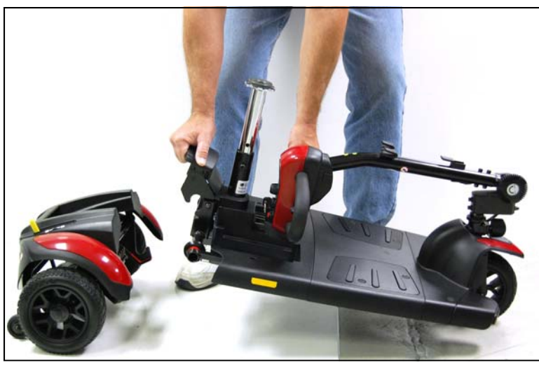
Figure 20. Connecting Frame and Drivetrain