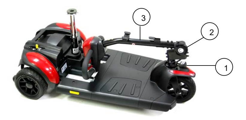
Figure 16. Lowered Tiller

6. Push in and turn the tiller lock clockwise 90 degrees. See #1 on figure 16. This will lock the front wheel to keep it from turning side to side to help control while carrying.