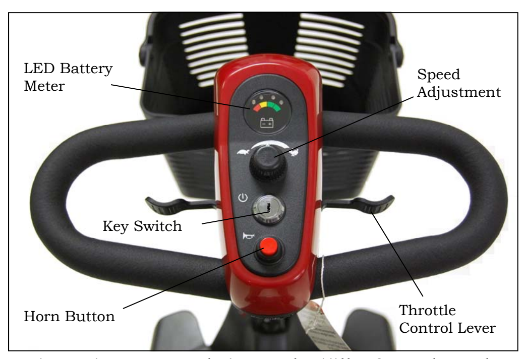
Figure 5. Buzzaround Lite<sup>TM</sup> Delta Tiller Control Panel