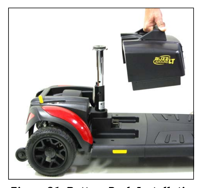
Figure 21. Battery Pack Installation