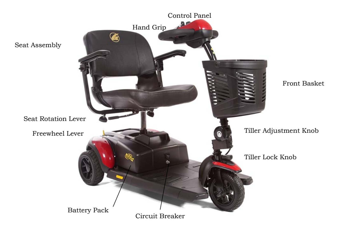
Figure 4. Your Golden Buzzaround Lite™ (Model GB107)