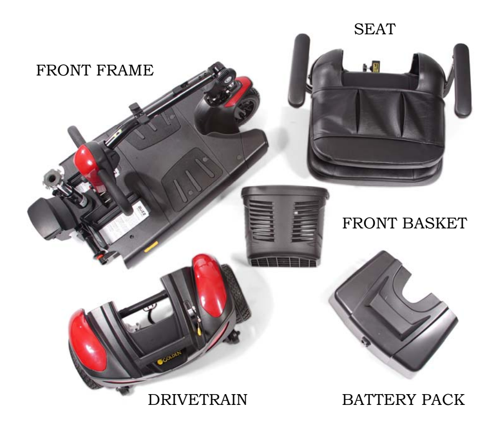
Figure 18. Buzzaround Lite™ Components (Model GB107)

Ensure that all components in the scooter have been correctly assembled. During assembly, please check that all connecting/locking devices are holding in place.