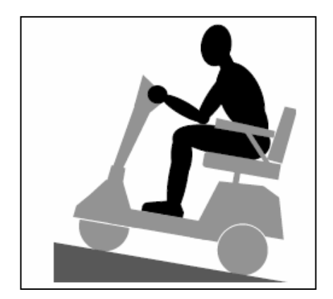
Figure 2. Going Up an Incline