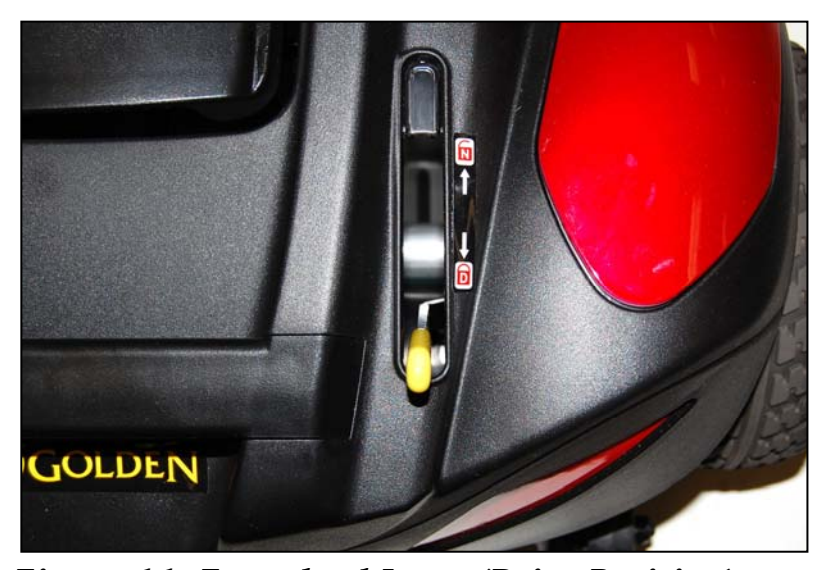
Figure 11: Freewheel Lever (Drive Position)

Your Buzzaround Lite™ is equipped with a freewheel lever that can set your scooter in or out of freewheel mode.