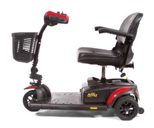
Figure 24. Buzzaround Lite™ (Model GB107)

All Golden Buzzaround Lite scooters can be equipped with docking devices for loading onto a vehicle by means of a mechanical lift or hoist. Contact your Golden Technologies, Inc. provider for more information concerning docking devices and scooter lift devices.