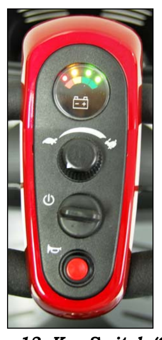
Figure 13. Key Switch (On)