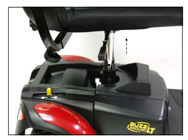
Figure 8: Seat Rotation Adjustment